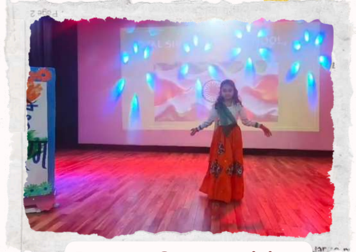
Dance Competition (Class I)