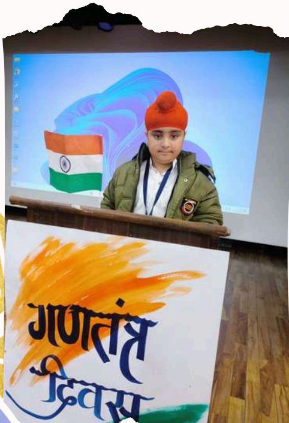
Deshbhakti Kavita Partiyogita (Class II)