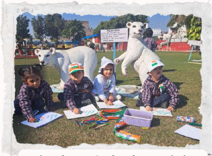
Tricolour Splash Activity (Class Nur.-UKG)

Activities conducted to celebrate Republic Day for classes I to VIII were –