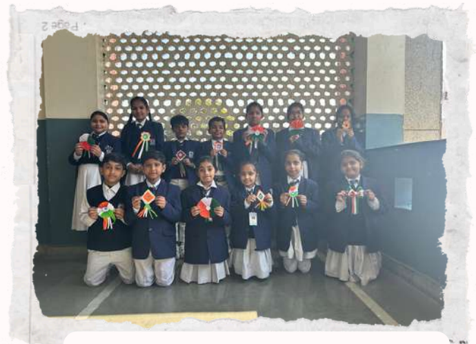
Badge Making Activity (Class III-VIII)